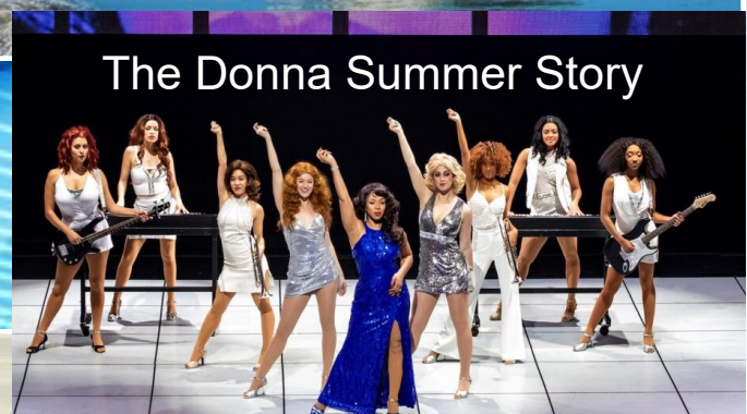
The Donna Summer Story