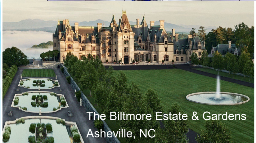
The Biltmore Estate & Gardens Asheville, NC