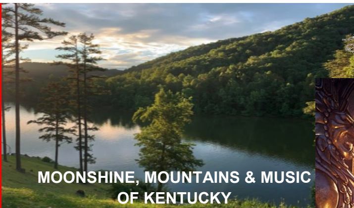
MOONSHINE, MOUNTAINS & MUSIC OF KENTUCKY