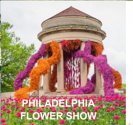
PHILADELPHIA FLOWER SHOW